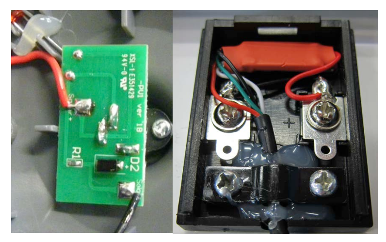
Figure 1. Examples of DUTs containing "a circuit board or other sensitive electronics" and requiring water ingress testing.