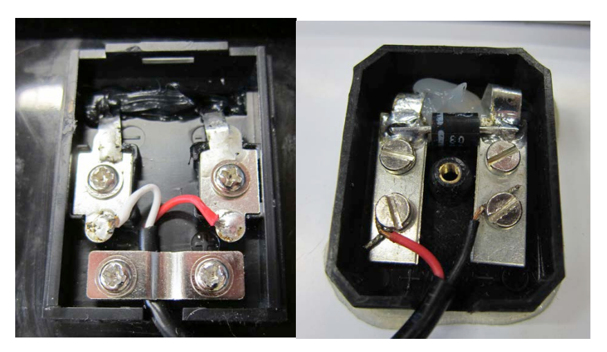
Figure 2. Examples of DUTs not containing "a circuit board or other sensitive electronics" and not requiring water ingress testing. (The junction box on the right contains a diode.)