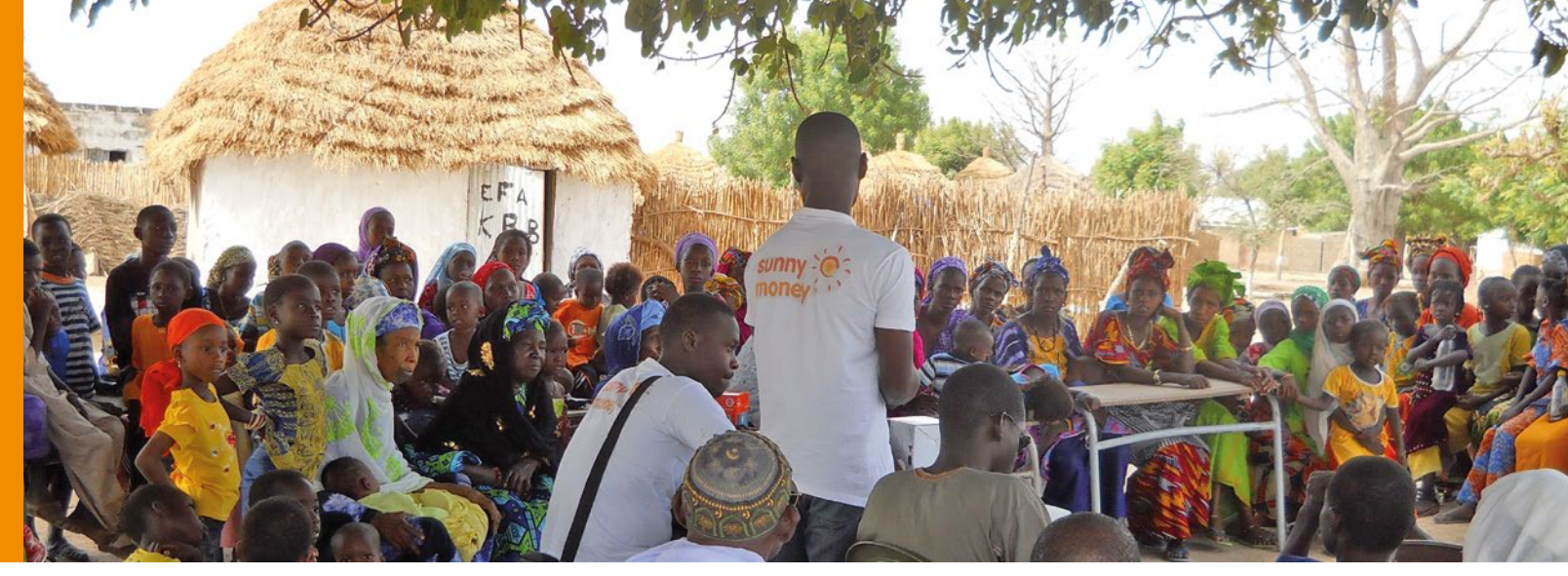
The SunnyMoney team, Senegal.