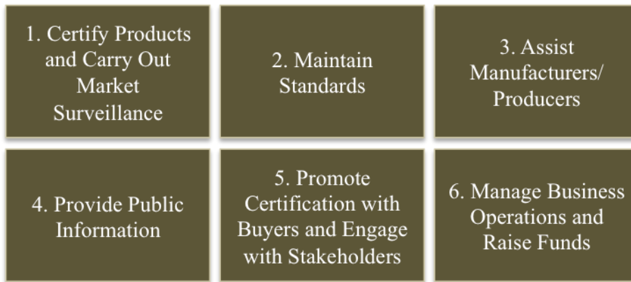
Figure 1: Off-Grid Lighting Certification Body, Main Functions

IFC envisions that the Certification Body would have six main functions as shown below in Figure 1 and then described below. The core work of the Certification Body would be to receive applications for certification of specific products and then to provide certification once products prove conformity with standards. This work will entail the management and further development of a network of accredited third party laboratories and accreditation bodies. In addition, the Certification Body would undertake a range of other activities to support the success of the certification in the marketplace.