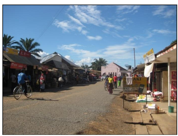
Figure 10. The main street and market area of Ifakara.