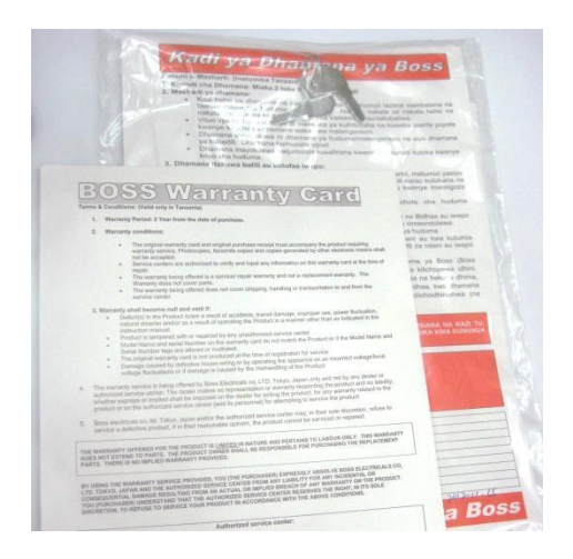
Figure 3. An appliance manufacturer, BOSS, found that translating their warranty card and terms into Swahili increased understanding of the warranty and reduced the number of disputes related to ineligible returns.

To further minimize potential conflicts between a retailer and customer, all warranty information should be presented in simple terms in a regionally-appropriate language and retailers should be encouraged to discuss the warranty terms with customers prior to purchase. (Figure 3).