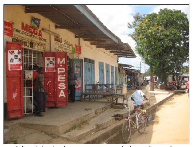
Figure 11. The main street of Ruaha/Kilombero. Most commercial activity in the town occurred along the main street or in a small market on the side streets.