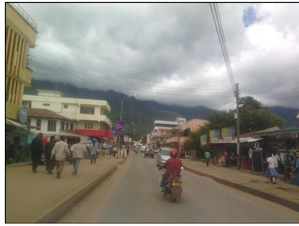
Figure 9. Major retail areas of Morogoro. Morogoro was the largest municipality surveyed during the study.