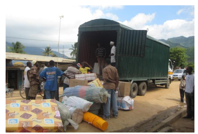
Figure 2. A bus station in Moshi and a supply truck in Ruaha. Common ways of transporting individual products in Tanzania include sending them as cargo on mini-buses or buses, or adding them to a shipment of goods on a lorry truck.

Transporting products is a major obstacle to effectively servicing warranties. Most retailers said they could ship products by mini-bus, bus, or truck, which would cost between US$ 6-20 roundtrip, depending on the size and value of the product (Figure 2). This shipping cost is often greater than the purchase price of lower-cost solar lighting products, making product returns uneconomical.