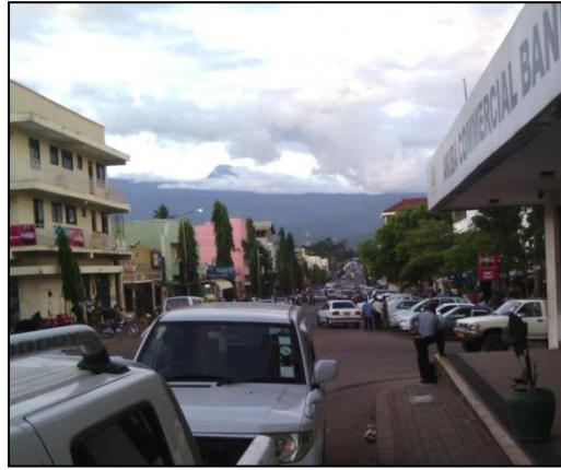
Figure 6. Retail mall and busy central street in Moshi, Tanzania.