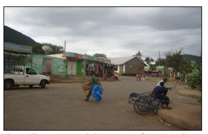
Figure 8. The main street and bus station in Same. Same was the smallest town sampled in Tanzania.