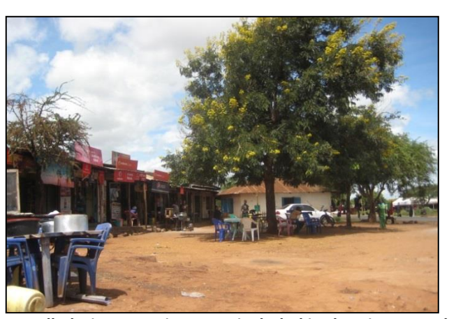
Figure 7. Both the central town of Himo and the roadside area called Himo Junction were included in the Himo sample.